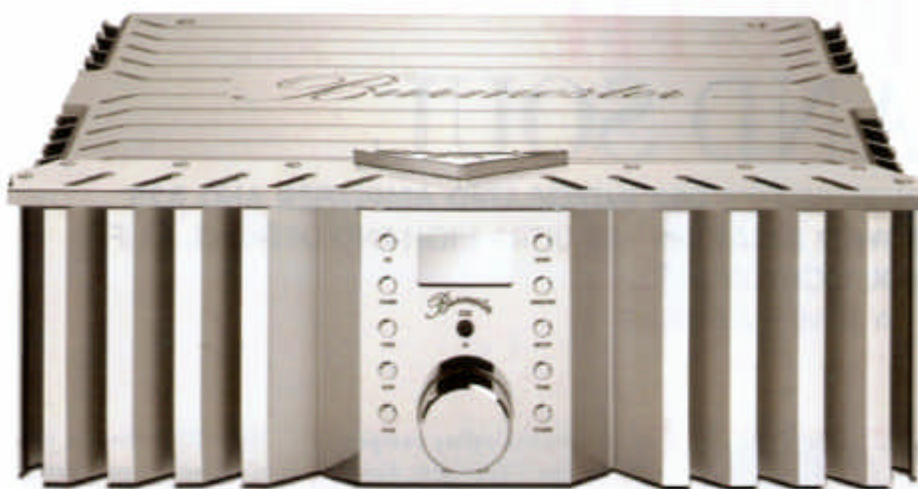
The 032's chrome-plated chassis is also its heat sink.